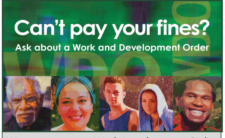
We can sponsor a Work Development Order for you to help deal with unpaid fines.

We can assist customers stay connected to essential energy services in an crisis situation. Maximum amounts apply for each Financial Year.